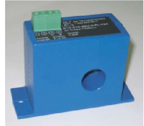
DT SERIES Solid Core 0-20 or 4-20 mA; 0-5 or 0-10 VDC Outputs